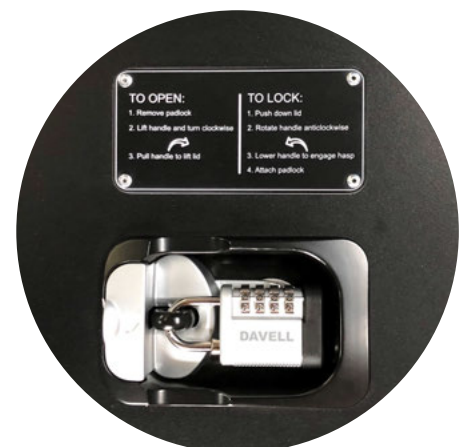
Handle with Operating Instructions (optional padlock)