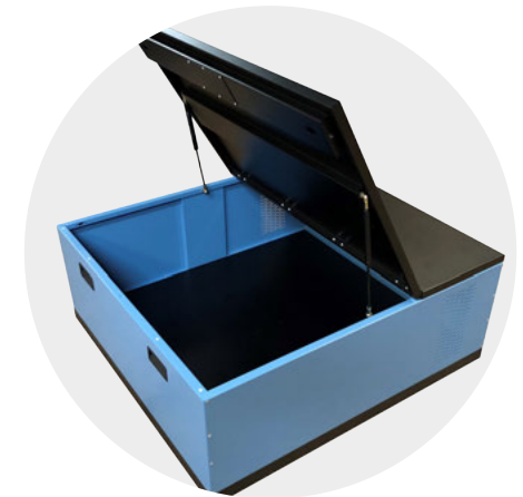
Dual Gas Struts