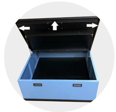
Three Point Locking

Proudly made in Australia by an Australian owned company.